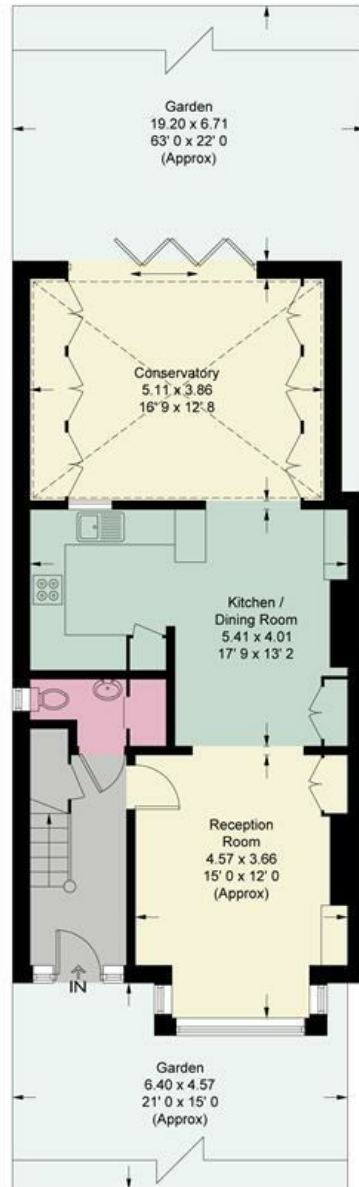
Ground Floor 721 sq ft / 67 sq m